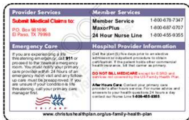
Beneficiary ID Card back

The ID Card above is a sample. The copays shown are examples only.