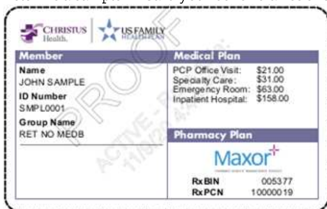
Beneficiary ID Card front

Below is a sample ID Card your beneficiaries should present at all appointments.